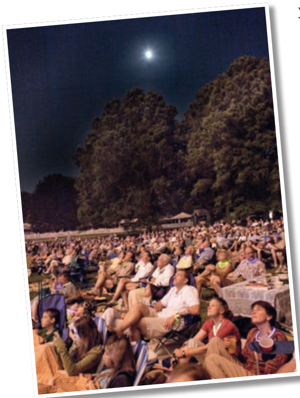
Hagley membership includes many benefits, just one of which is Hagley's members-only fireworks shows in June.

And, to save time and postage, you can renew your membership online at www.hagley.org or call the membership office weekdays at (302) 658-2400, ext. 235.