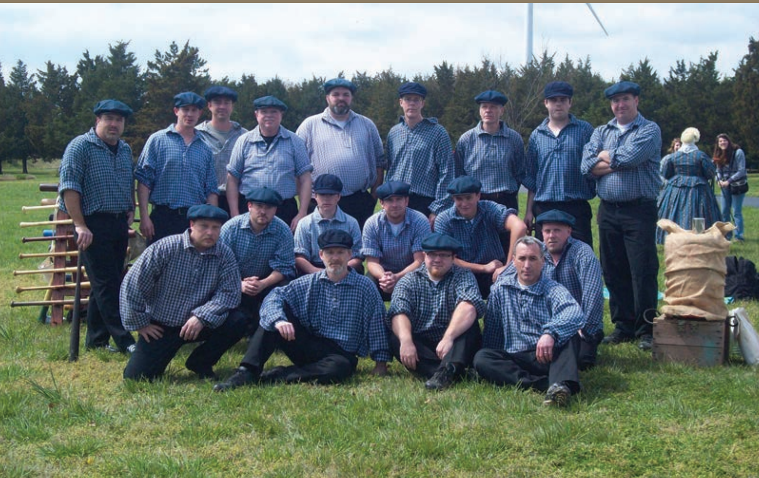
The 2012 Diamond State Base Ball Club.