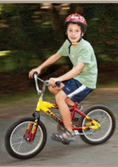
A young visitor rides through the property at one of Hagley's Bike and Hike evenings.

For guided tours, research library hours, and event details, visit www.hagley.org .