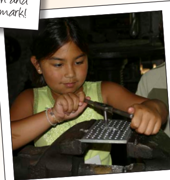
I got to operate this machine in a working Machine Shop!

"It's an educational view of fun, or vice-versa."