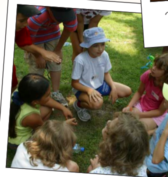
We learned a lot of new games that didn't need batteries!