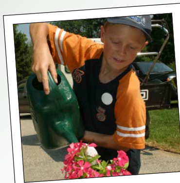
I couldn't wait to show my mom what I learned about plant care!

Campers will take on engineering challenges, while learning how engineers have helped to shape our world from the time of water wheels and steam engines to Lycra and Teflon.