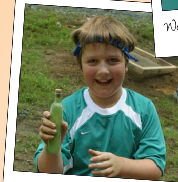
Finding objects on an archaeological dig was fun!

"My son really liked the camp and I was impressed with how much he learned."