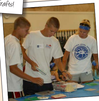
The counselors were great! I really learned a lot from them!

"A very nice hands-on camp for a very reasonable price."