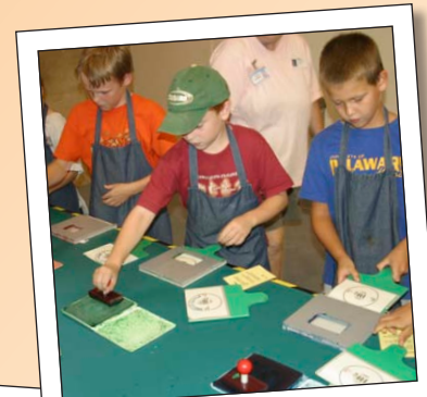
We learned about assembly lines at the keg label factory!

"It's very cool and fun, the best camp I have been to."