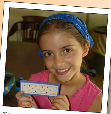
I learned how to cross-stitch and made myself this cool bookmark!