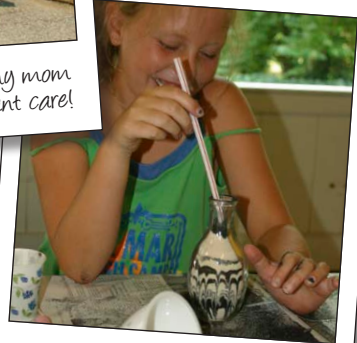
Making bottled sand art was so much fun!

"We learned a lot and had fun doing it."