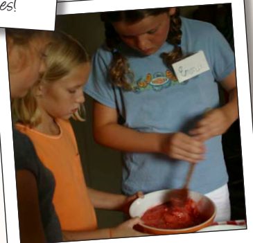
We made delicious jam the way they did in the 1800s!

"I learned that the only school days used to be Sundays."