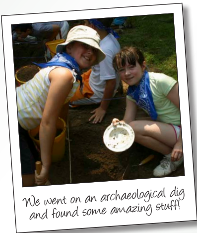
We went on an archaeological dig and found some amazing stuff!

Campers will get to try out some of the skills children used every day in the 1800s. Before shopping malls and McDonalds, children learned to make their own clothes and toys, prepare snacks from fresh ingredients, woodwork, fish, and many other "lost arts".