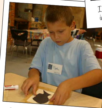
I made a silhouette of myself and other great arts and crafts!

"It's an educational view of fun, or vice-versa."