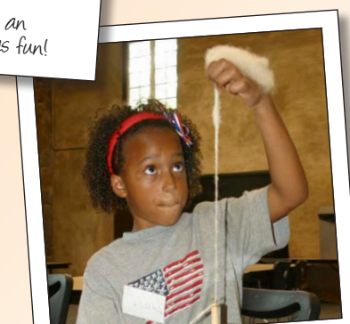
One day we learned how to spin yarn out of wool!

"It was a lot of fun because I was outside and getting exercise instead of sitting around on the couch watching tv."