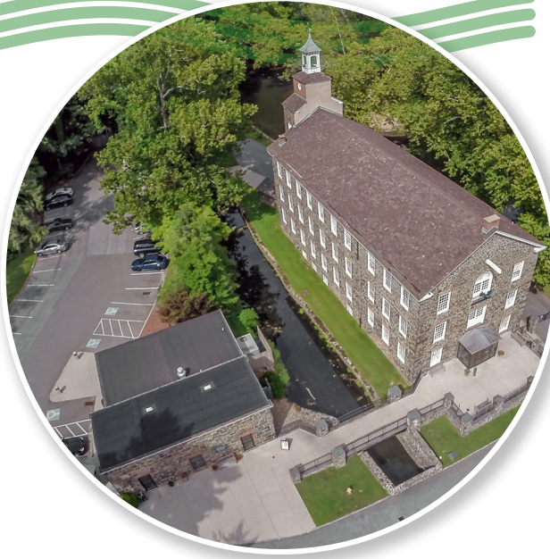
HAGLEY STORE AND VISITOR CENTER

T HE BEAUTIFUL STONE BUILDING that houses the Hagley Store has an interesting past as part of the textile tradition of mills along the Brandywine. It was built in 1822-1823 for the cleaning and picking of raw cotton that supported the cotton spinning mill next door, now the Hagley Visitor Center. Baled cotton had to be unpacked and the fibers loosened, fluffed, and picked clean of seeds. This step in the textile operation was hazardous and likely to cause a fire. Therefore, the building was designed to be fireproof and built entirely of stone, brick, and iron. When the DuPont Company took over the building in the 1880s, it was used to store paints, as a carpenter's shop, and for making metal caps for powder kegs.