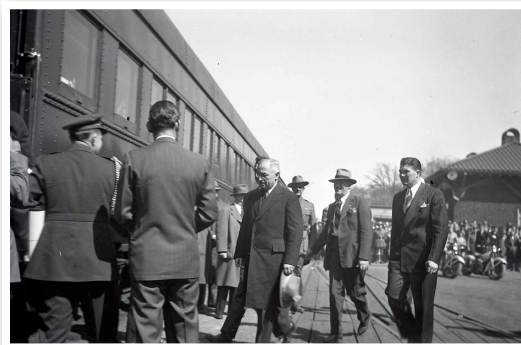
THE AEROTRAIN IN PITTSBURGH, PENNSYLVANIA, 1956