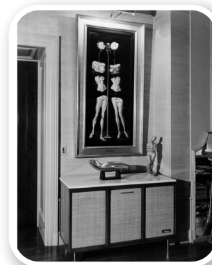
RADIO PERCHED APPROPRIATELY ABOVE A ZENITH STRATOSPHERE CONSOLE