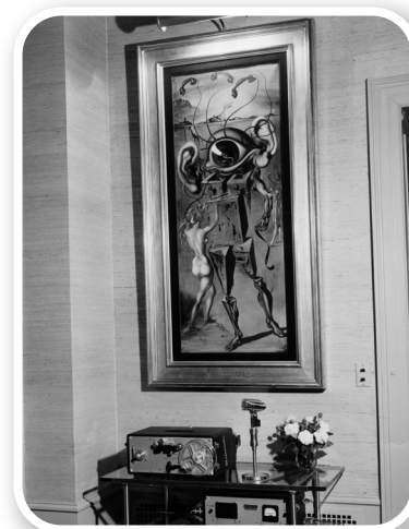
THE PAINTING CINEMA , (LABELED HERE AS MOVIES ) ABOVE A SET OF RECORDING EQUIPMENT.

These weird and darkly whimsical paintings were among Dalí's best works of the 1940s. Though their fate is tragic, it is nonetheless fortunate that further knowledge of how and where they were displayed has surfaced. It is thrilling, after all these years, to be able to observe their original appearance, tantalizing as that glimpse is.