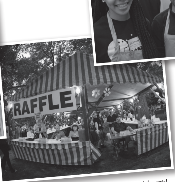
Volunteers interact with families at special events such as Invention Convention, Hagley Car Show, Fireworks, and more!