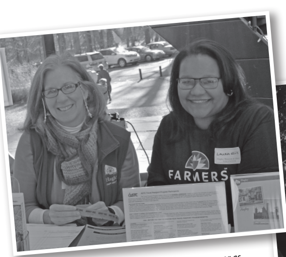
Hagley welcomes volunteers who come on their own or as part of a group or business.

My Profile tab — ONCE click on Contact Information scroll down and on right side Subscriptions click Subscribe weekly reminders, update all other information here