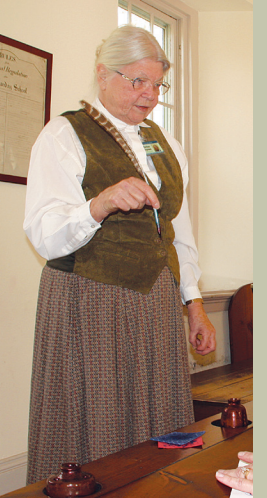
Get Involved Continue Learning Share Your Talents