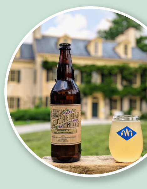
IN 2021 WILMINGTON BREW WORKS BEGAN A PARTNERSHIP WITH HAGLEY, USING FRUIT FROM THE E. I. DU PONT GARDEN TO CREATE A NEW LINE OF CIDERS CALLED "THE FRUITS OF ELEUTHERIAN MILLS."